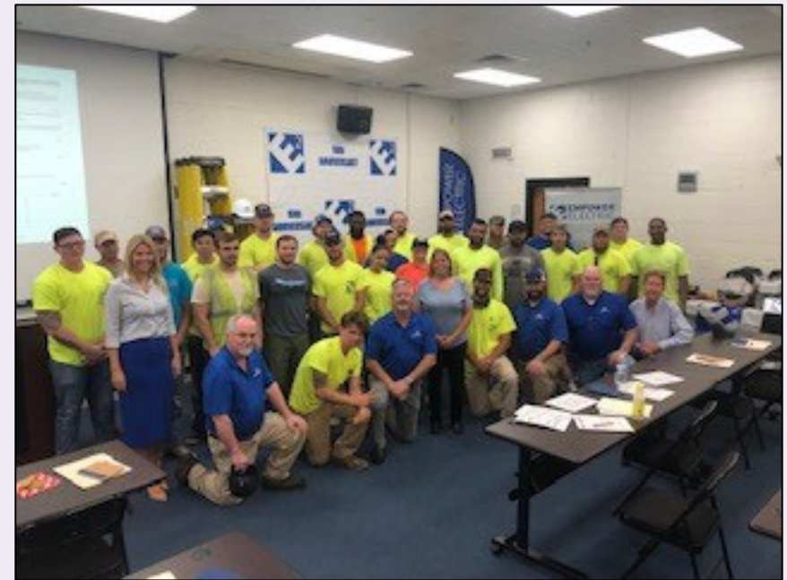
Empower Electric Apprenticeship Signing Day, Nashville